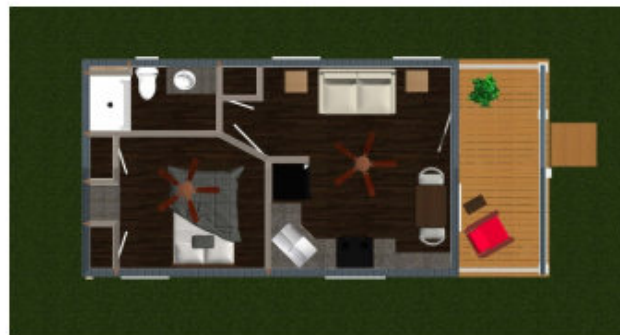
Village I, 390 sq. ft.

Our homes meet ENERGY STAR "U.S. DOE Zero Energy Ready Home" criteria. We are currently seeking certification for this, which also requires plant (the construction facility) certification. The "Zero Energy Ready Home" criteria ensures that the home is a high-performance home whose energy use could be mostly offset with a renewable energy system (solar panels). Our homes are solar-ready, and we have solar packages available as an option, both for grid-tied and off-grid applications.