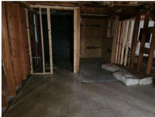
floor 1 studio unit