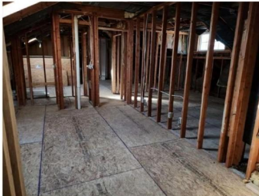
floor 4 3-bedroom unit