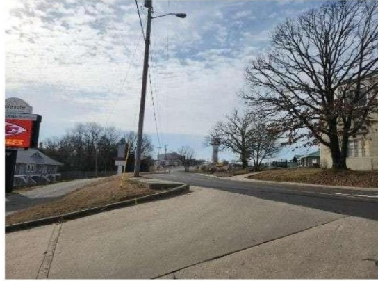
Gretna Rd frontage, view south, subject on left after sign