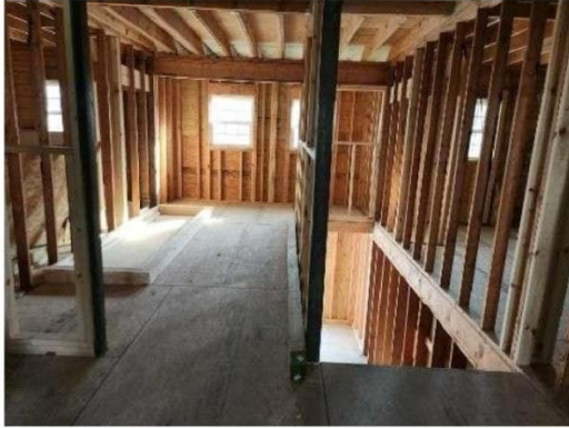
floor 3 common interior stairwell with laundry room