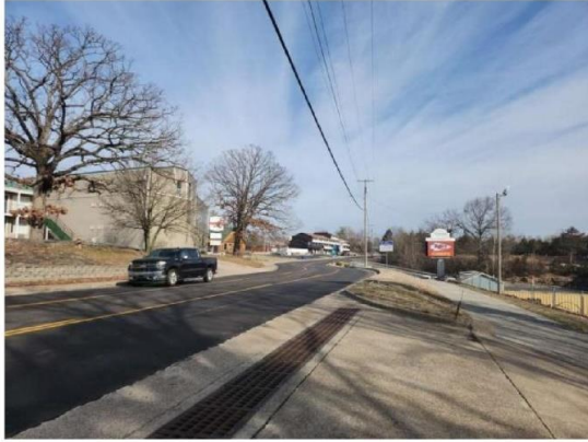
Gretna Rd frontage, view north from subject driveway