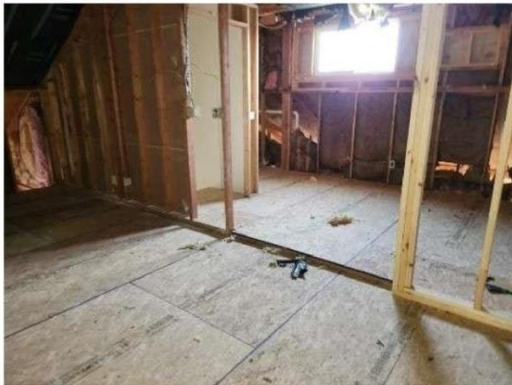
floor 4 studio unit