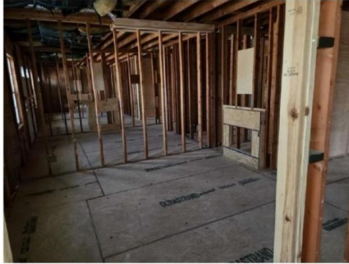
gutted interior floor 3