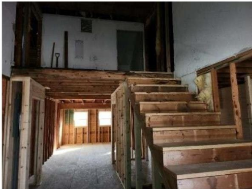
interior stairwell access to floor 4